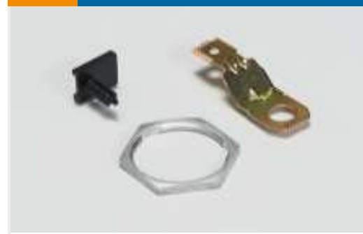
Other Automotive Connector Accessories(13)