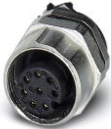
Sensor/actuator flush-type connector, socket, 8-pos., M12 SPEEDCON, A-coded, shielded, rear/screw mounting with M12 thread, with straight THR solder connection

Please be informed that the data shown in this PDF Document is generated from our Online Catalog. Please find the complete data in the user's documentation. Our General Terms of Use for Downloads are valid ( http://phoenixcontact.com/download )