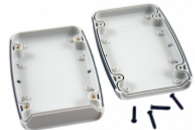
Key Internal Features