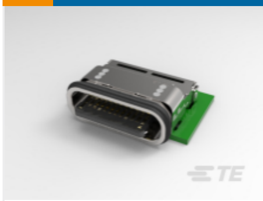
TE Part # 2305018-2 USB TYPE C, REC IPX8 ON BOARD DUAL SMT