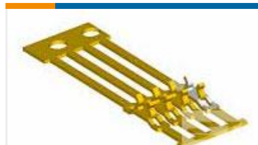
TE Part #1544301-2 CONTACT A SOUDER