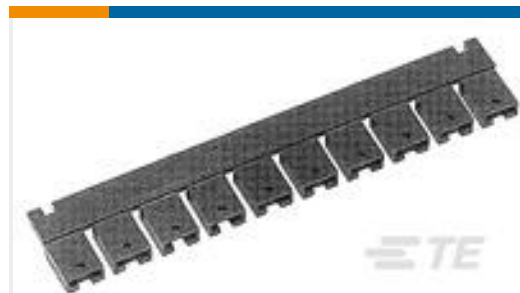
TE Part #382811-6 SHUNT, ECON, PHBR 15 AU, BLACK