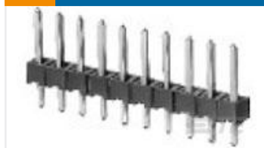
TE Part #5-146281-3 03 MODII HDR SRST B/A LF