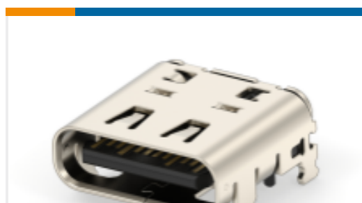
TE Part #2385692-1 USB4 RECPTACLE ON BOARD