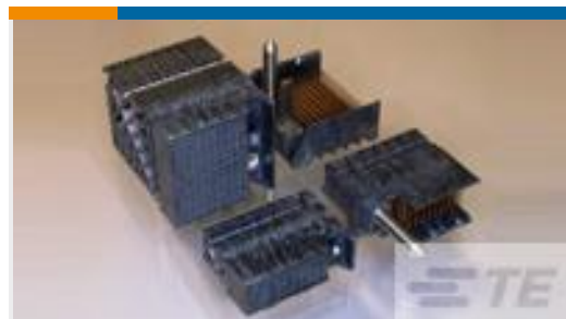
TE Part #2007820-1 IMP100S,H,V4P10C,UG,OEW39,4.5