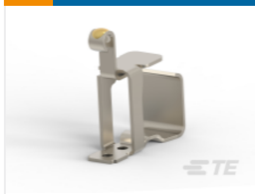
TE Part # 2388202-2 Shield Finger, 3.8mm