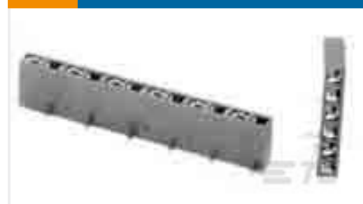
TE Part #1241152-5 5P HV100 REC. CON, SMD, GOLD, BLISTER