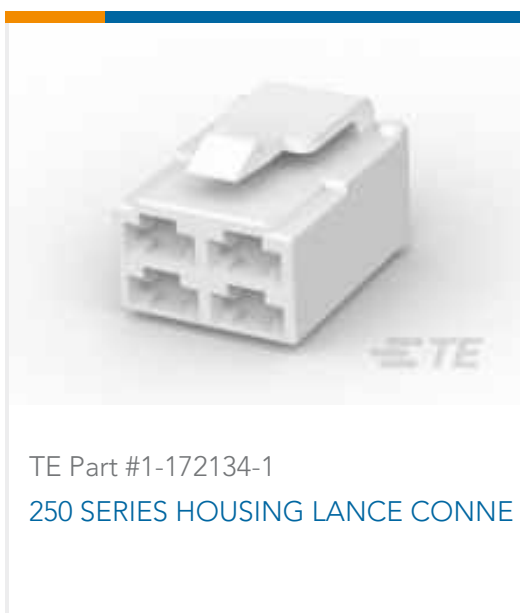
TE Part #1-172134-1 250 SERIES HOUSING LANCE CONNE