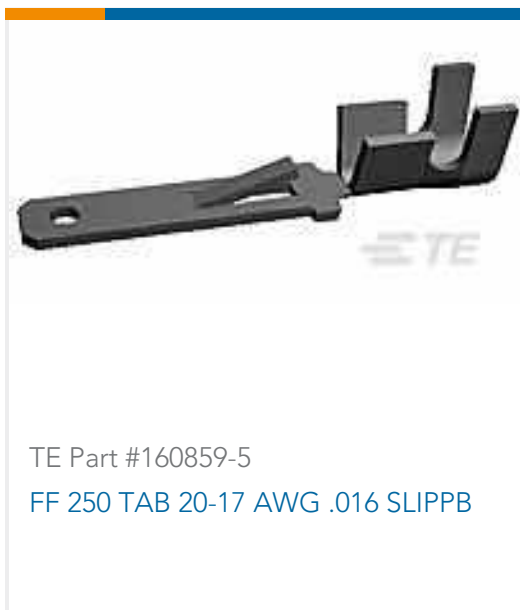
TE Part #160859-5 FF 250 TAB 20-17 AWG .016 SLIPB