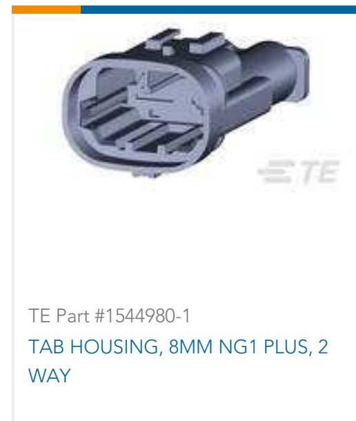
TE Part #1544980-1 TAB HOUSING, 8MM NG1 PLUS, 2 WAY