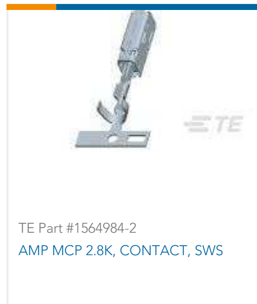
TE Part #1564984-2 AMP MCP 2.8K, CONTACT, SWS