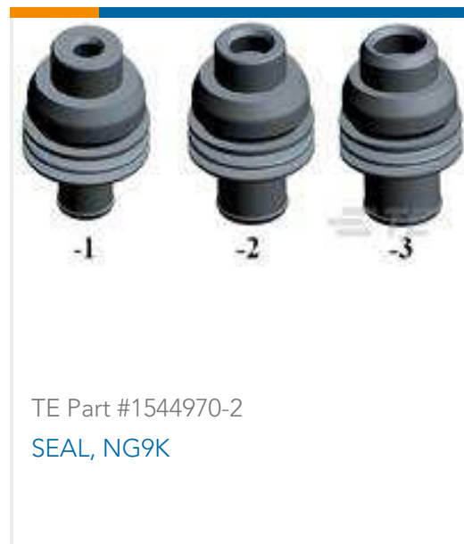
TE Part #1544970-2 SEAL, NG9K