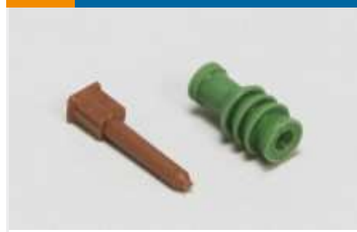
Automotive Seals & Cavity Plugs(7)