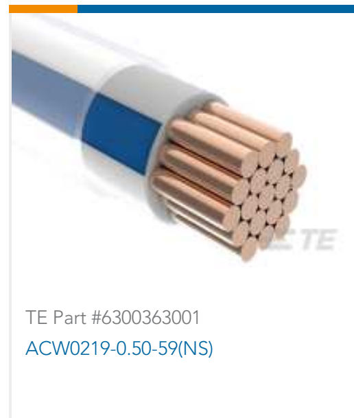
TE Part #6300363001 ACW0219-0.50-59(NS)