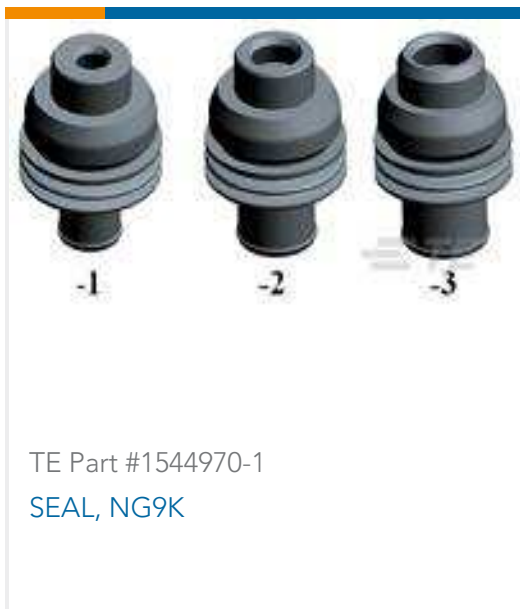
TE Part #1544970-1 SEAL, NG9K