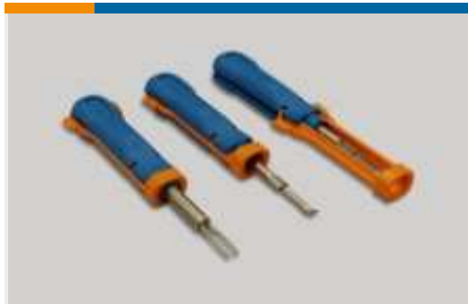
Insertion & Extraction Tools(13)