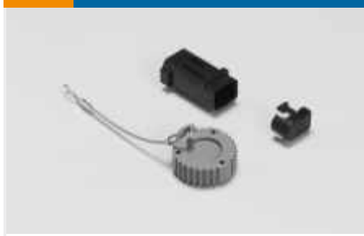
Automotive Connector Caps & Covers (2)