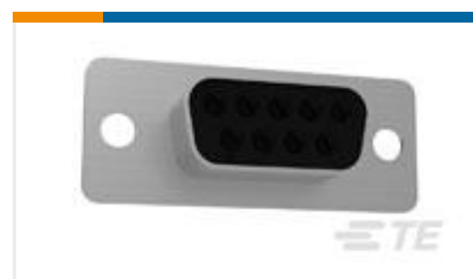
TE Part #164531-4 9P.HDP20 REC.ASSY.