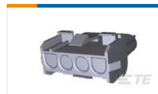
TE Part #350780-1 04P UMNL CAP HSG