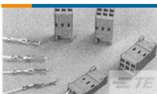
TE Part #281839-3 HOUSING HE13 HE14 COSI 2X3 P