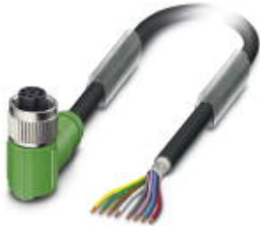
Sensor/actuator cable, 8-position, PUR halogen-free, black-gray RAL 7021, shielded, free cable end, on Socket angled M12, A-coded, cable length: 1.5 m

Please be informed that the data shown in this PDF Document is generated from our Online Catalog. Please find the complete data in the user's documentation. Our General Terms of Use for Downloads are valid ( http://phoenixcontact.com/download )