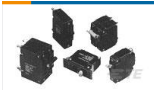
TE Part #6-1393252-1 W67-X2Q12-30=M6/M7/M9/W6/W7