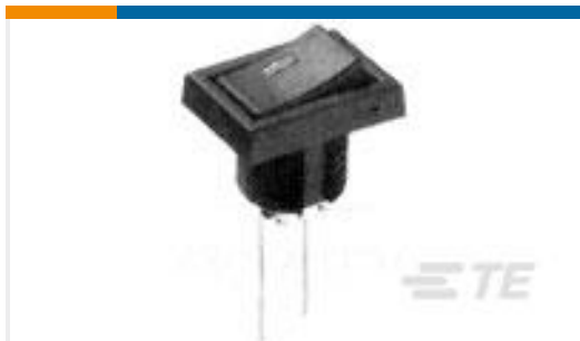
TE Part #5-1437595-2 TRD11F10WL=SUB MINI ROCKER BLA