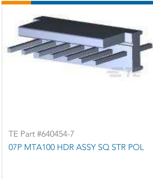
TE Part #640454-7 07P MTA100 HDR ASSY SQ STR POL