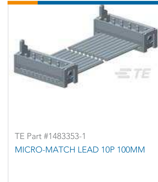
TE Part #1483353-1 MICRO-MATCH LEAD 10P 100MM