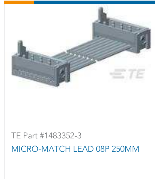
TE Part #1483352-3 MICRO-MATCH LEAD 08P 250MM