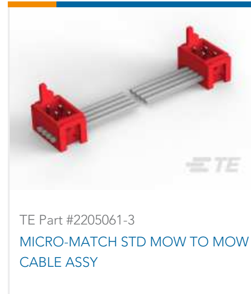
TE Part #2205061-3 MICRO-MATCH STD MOW TO MOW CABLE ASSY