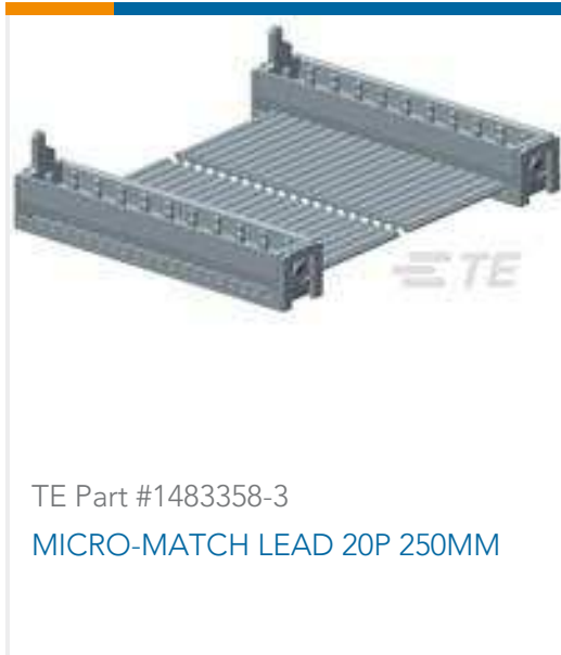
TE Part #1483358-3 MICRO-MATCH LEAD 20P 250MM