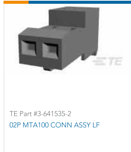
TE Part #3-641535-2 02P MTA100 CONN ASSY LF