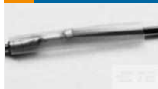
TE Part #CV21104001 RW-175-E-1/4-X-SP