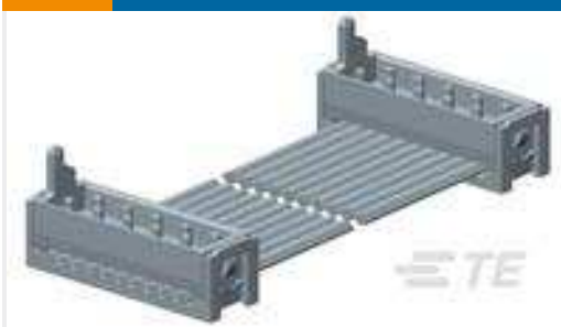
TE Part #1483353-1 MICRO-MATCH LEAD 10P 100MM