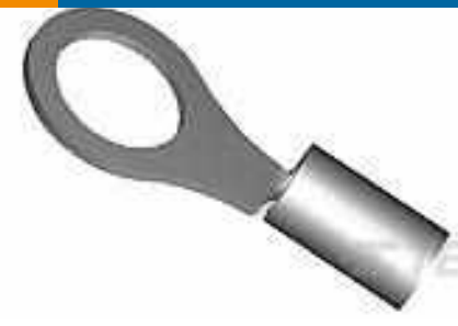
TE Part #321885 TERM, STRAT, SOLIS, HT R, 22-16, #5