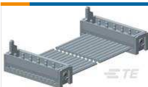
TE Part #1483354-2 MICRO-MATCH LEAD 12P 150MM