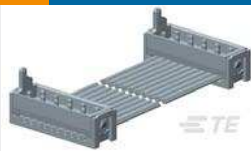
TE Part #1483353-3 MICRO-MATCH LEAD 10P 250MM