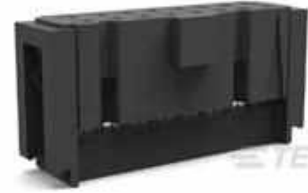
TE Part #1-1658527-0 622-2641LF FEM SOCKET, LEAD FREE