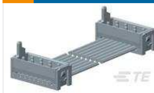
TE Part #1483352-2 MICRO-MATCH LEAD 08P 150MM