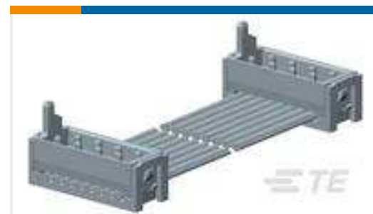
TE Part #1483352-1 MICRO-MATCH LEAD 08P 100MM