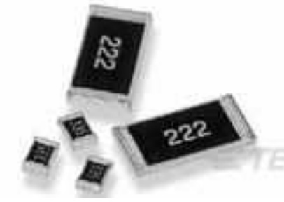
TE Part #1623107-1 CRG0805 1% 120R