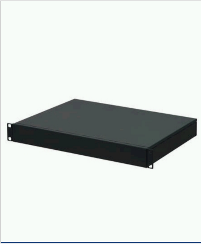
Illustration shows plain case