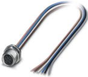
Sensor/actuator flush-type socket, 6-pos., M8, rear/screw mounting with M10 fastening thread, with 0.5 m TPE litz wire, 6 x 0.14 mm 2

Please be informed that the data shown in this PDF Document is generated from our Online Catalog. Please find the complete data in the user's documentation. Our General Terms of Use for Downloads are valid ( http://phoenixcontact.com/download )