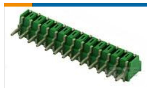
TE Part #1-5164711-0 10pos.MINI-MATCH FBTB, 2.5mm p