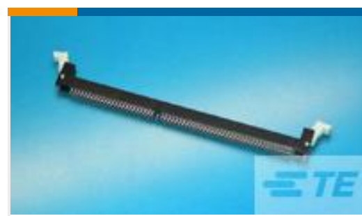
TE Part #1-1932000-1 VERTICAL DDR3 DIMM, 240 POSITION