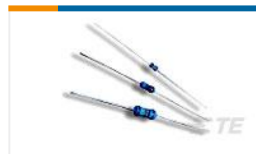
TE Part #1622461-1 LR1 1% 3K3