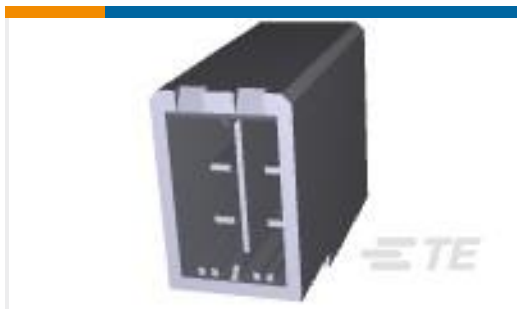
TE Part #1376133-2 DYNAMIC D-3500 HDR ASSY 4P