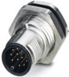
Sensor/actuator flush-type connector, plug, 12-pos., M12 SPEEDCON, shielded, A-coded, rear/screw mounting with Pg9 thread, with straight solder pins

Please be informed that the data shown in this PDF Document is generated from our Online Catalog. Please find the complete data in the user's documentation. Our General Terms of Use for Downloads are valid ( http://phoenixcontact.com/download )