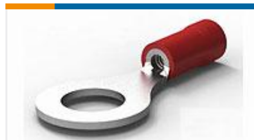
TE Part #34150 PG R 22-16 COMM 22-18 MIL 1/4