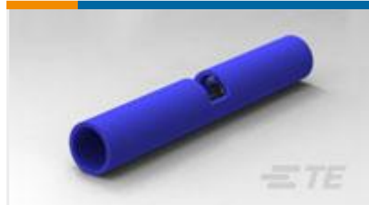
TE Part #320562 SPLICE BUTT PIDG 16-14