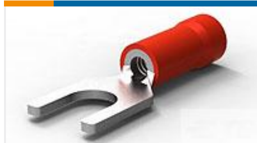
TE Part #165008 PLASTI-GRIP, SPADE 22-16 8