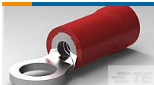
TE Part #34142 PG R 22-16 COMM 22-18 MIL 6