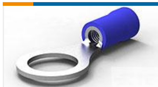
TE Part #34163 TERMINAL,PG R 16-14 5/16