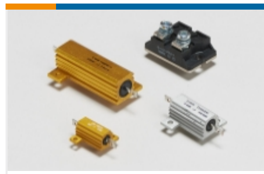
Chassis Mount Resistors(1068)