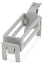
DIN rail mounting frame, design: B24, for contact inserts, Top frame

https://www.phoenixcontact.com/pc/products/1424337