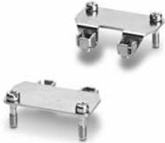
Adapter insert, design: D25

Please be informed that the data shown in this PDF document is generated from our Online Catalog. Please find the complete data in the user documentation. Our General Terms of Use for Downloads are valid.