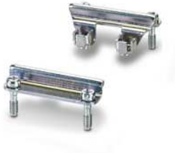
Adapter insert, design: D15

Please be informed that the data shown in this PDF document is generated from our Online Catalog. Please find the complete data in the user documentation. Our General Terms of Use for Downloads are valid.