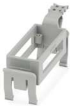
DIN rail mounting frame, design: B16, for contact inserts, Top frame

https://www.phoenixcontact.com/pc/products/1424336