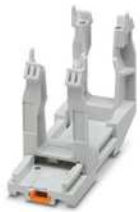
DIN rail mounting frame, design: B6 - B24, for contact inserts, Base frame

https://www.phoenixcontact.com/pc/products/1424338