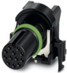
Sensor/actuator flush-type socket, 12-pos. with shroud, A-coded, with angled solder connection, contact insert only

Please be informed that the data shown in this PDF Document is generated from our Online Catalog. Please find the complete data in the user's documentation. Our General Terms of Use for Downloads are valid ( http://phoenixcontact.com/download )