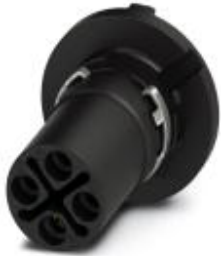
Flush-type connector, Universal, 4-position, Socket, Link: straight, S power, PCB mounting, THR solder connection

Please be informed that the data shown in this PDF Document is generated from our Online Catalog. Please find the complete data in the user's documentation. Our General Terms of Use for Downloads are valid ( http://phoenixcontact.com/download )