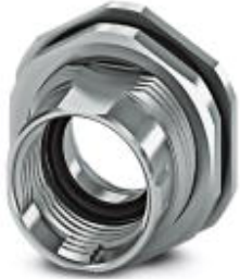
Housing screw connection, Socket, M12-SPEEDCON, Rear mounting, M15 x 1

Please be informed that the data shown in this PDF Document is generated from our Online Catalog. Please find the complete data in the user's documentation. Our General Terms of Use for Downloads are valid ( http://phoenixcontact.com/download )