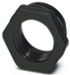
Reducing adapter, material: Polyamide fiberglass reinforced, connecting thread: M32 x 1.5, color: black, with flat gasket

Reducing adapter - REDUC-K-KV-M32/M25 BK - 1410712