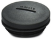
Filler plug, plastic, size: M32