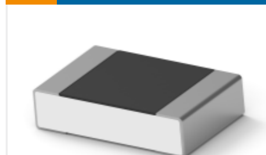
TE Part #7-2176373-7 RQ 0805 61R9 0.1% 10PPM 1K RL