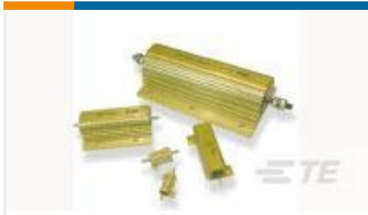
TE Part #9-1625966-8 HSA10 10R 1%