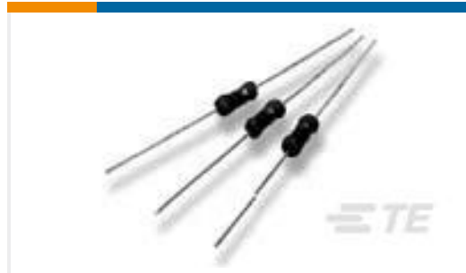
TE Part #5-1879350-2 RR01 5% 30R AMMO