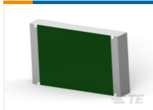
TE Part #5-2176400-2 3540 130R 1%