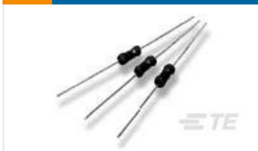
TE Part #5-1879351-5 RR01 5% 510K AMMO