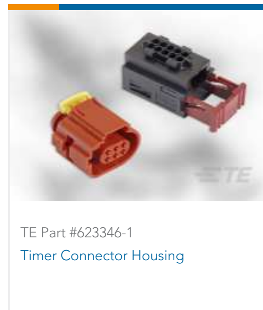
TE Part #623346-1 Timer Connector Housing