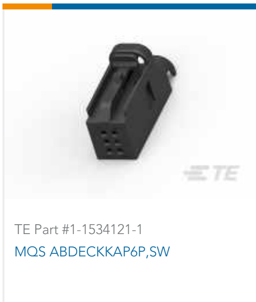
TE Part #1-1534121-1 MQS ABDECKKAP6P,SW