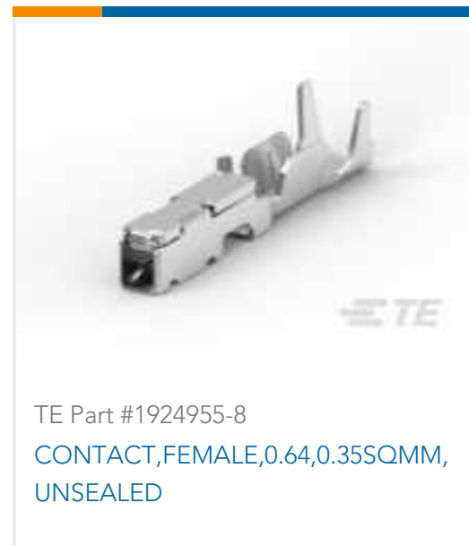
TE Part #1924955-8 CONTACT,FEMALE,0.64,0.35SQMM, UNSEALED