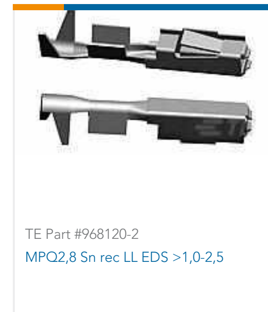
TE Part #968120-2 MPQ2,8 Sn rec LL EDS >1,0-2,5