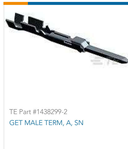
TE Part #1438299-2 GET MALE TERM, A, SN