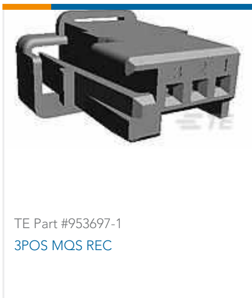
TE Part #953697-1 3POS MQS REC