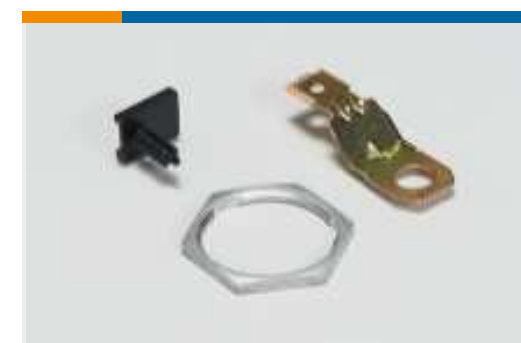
Other Automotive Connector Accessories(13)