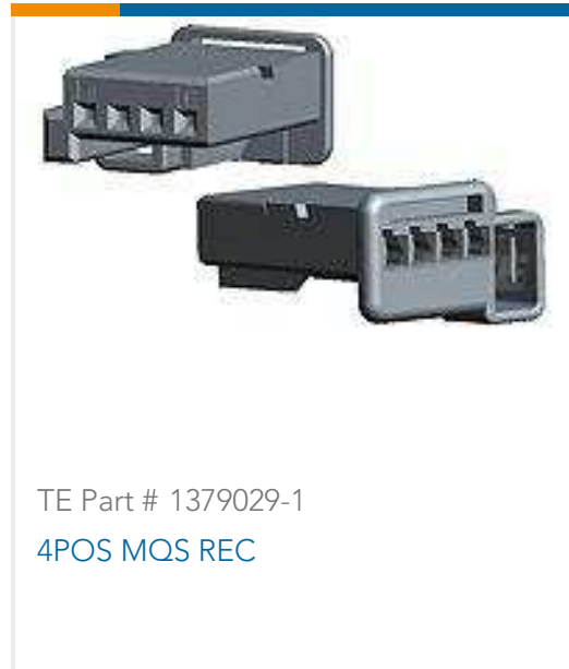
TE Part # 1379029-1 4POS MQS REC