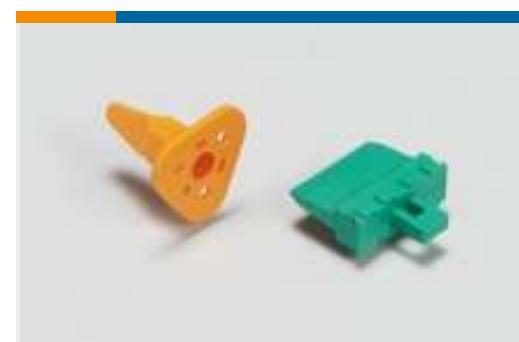
Automotive Connector Locks & Position Assurance(29)