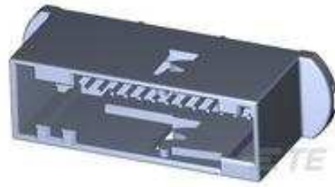
TE Part #2-966658-2 32pos MQS .63 header 180deg