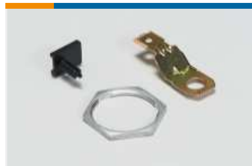
Other Automotive Connector Accessories(13)