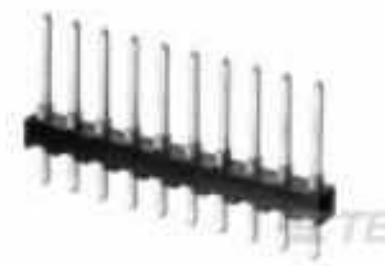
TE Part #1-825440-5 MOD 2 PINHDR 2X15P.