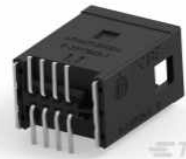
TE Part #2317523-1 2X4POS,NANOMQS,HDR ASSY, 180DEG,SMD,COD A