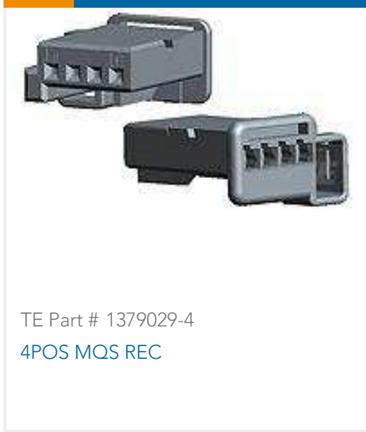
TE Part # 1379029-4 4POS MQS REC