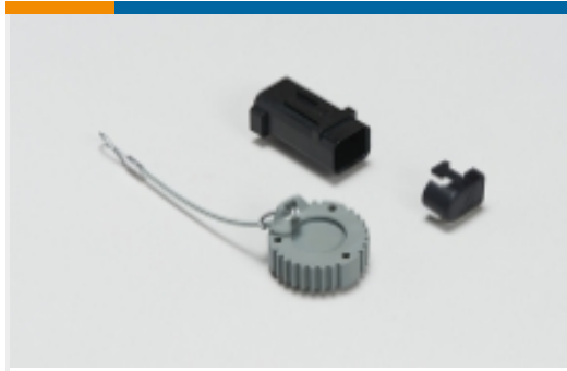
Automotive Connector Caps & Covers (19)