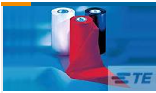
TE Part # F55910-000 1330-0620-10