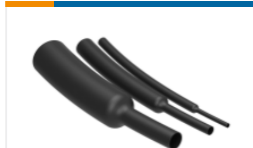
TE Part #2499356001 CGPT-R-2.4-0