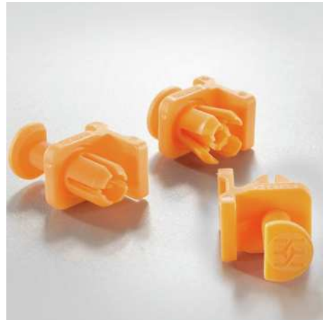
Lower assembly costs Secure in a matter of seconds