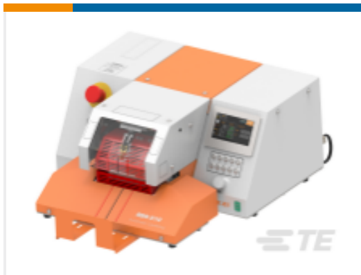
TE Part # 2376800-2 RBK-X1C CE STD