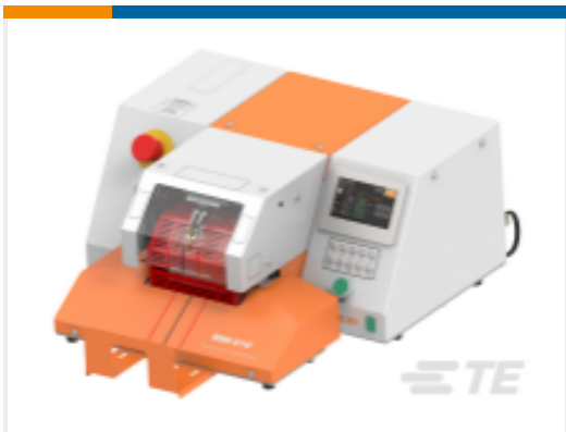
TE Part # 2376800-1 RBK-X1C STD