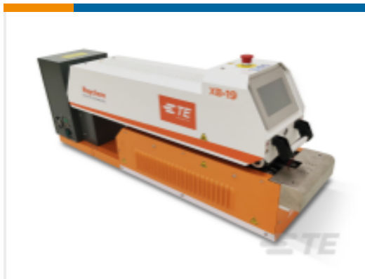
TE Part # 2375320-1 XB19 Belt Heater, STD