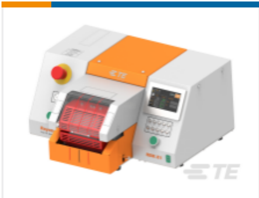
TE Part # 1-2234800-1 RBK-X1, AUTO TRIGGER