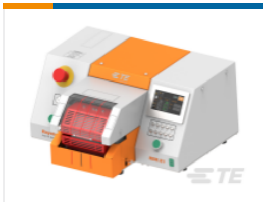
TE Part # 2234800-1 RBK-X1 STD