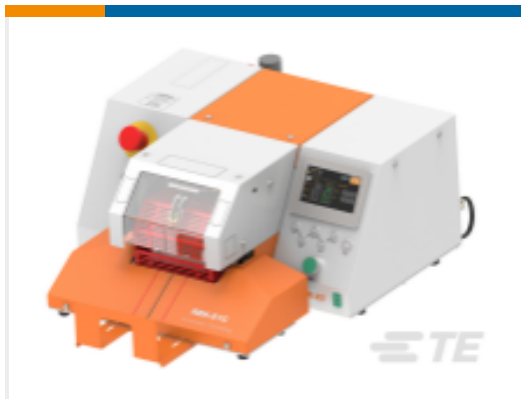
TE Part # 1-2376800-3 RBK-X1C, W/ AIR COOLING