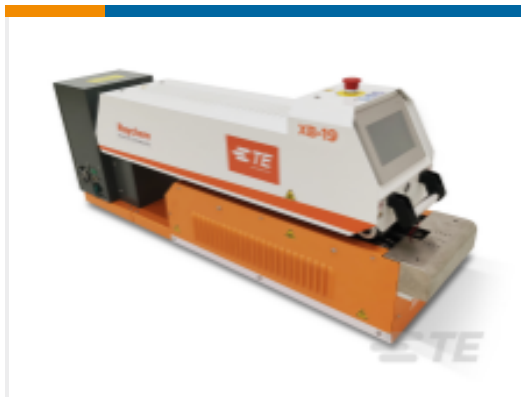
TE Part # 2375320-2 XB19 Belt Heater, 150mm (6") Version