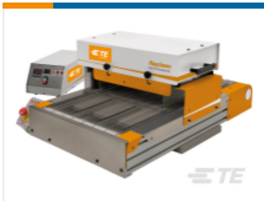
TE Part # 2326489-1 MODEL 105 TUNNEL OVEN, 36" ENTRY, STAND A