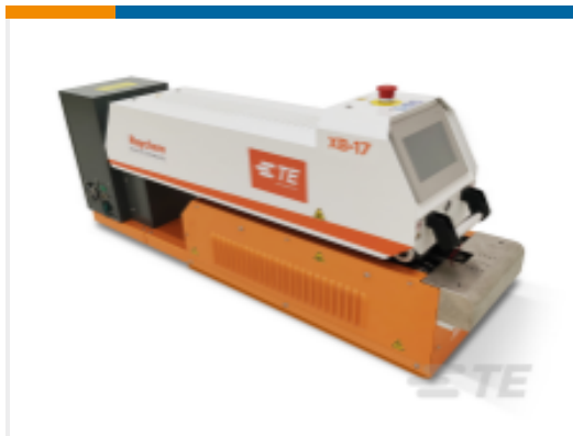
TE Part # 2375310-2 XB17 Belt Heater, 110V