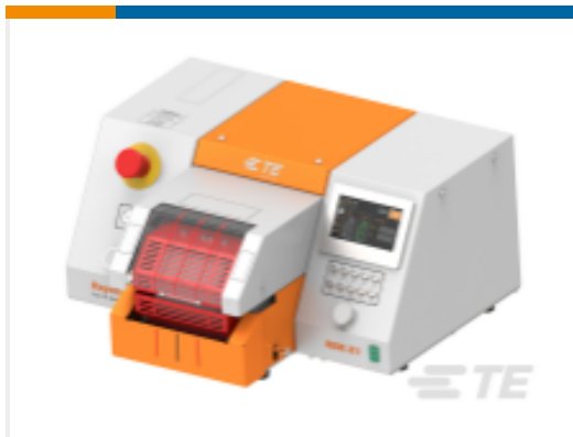
TE Part # 2234800-2 RBK-X1 CE STD