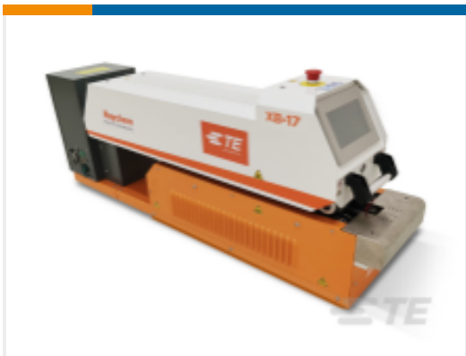
TE Part # 2375310-1 XB17 Belt Heater, 220V