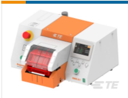
TE Part # 1-2234800-3 RBK-X1, W/ AIR COOLING