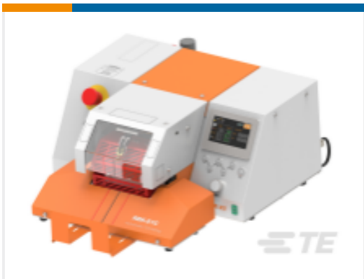
TE Part # 1-2376800-4 RBK-X1C CE, W/ AIR COOLING