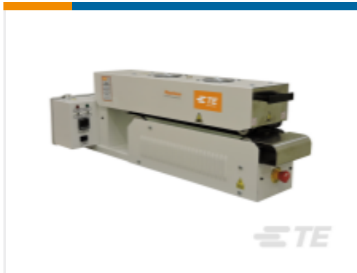
TE Part # 2280355-1 220 V MODEL 17