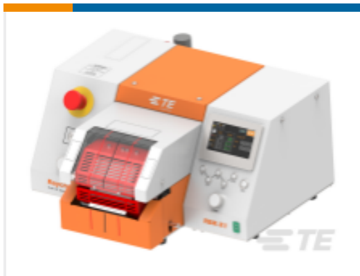
TE Part # 1-2234800-4 RBK-X1 CE, W/ AIR COOLING