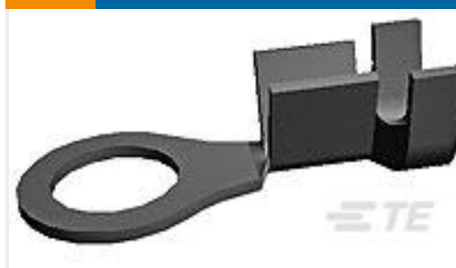
TE Part #40661 RING 190(4.82 MM) TERMINAL 18-14 AWG BR