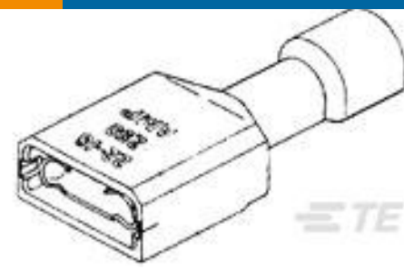
TE Part #2-520263-2 ULTRA-FAST 250 ASY REC 22-18 TPBR