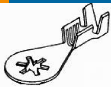
TE Part #640052-1 RING 18-14 AWG SST