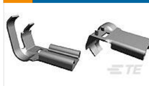
TE Part #42742-2 250 FASTON FLAG REC 18-12 AWG TPBR