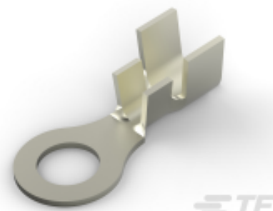
TE Part #41332-1 RING TERMINAL 18-14 AWG NPST