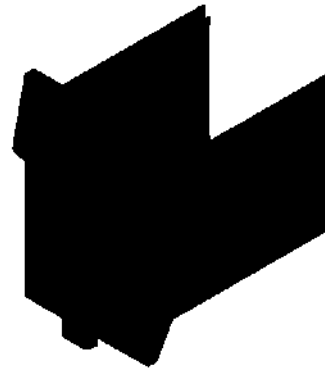
Base element without cut-out in snap-in foot area