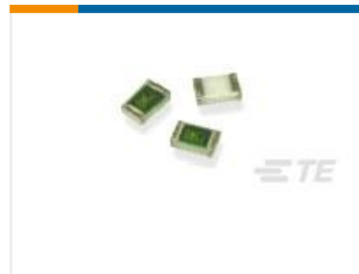
TE Part #4-1625867-8 RP 1J 0.166W 19R1 0.1% 25PPM 1K RL