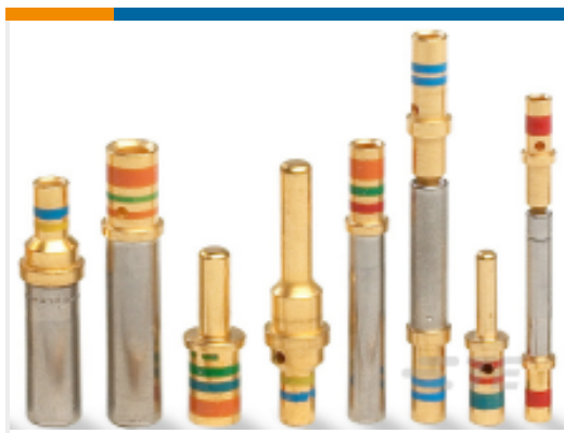
TE Part #12333-20 CONT SOC ASSY