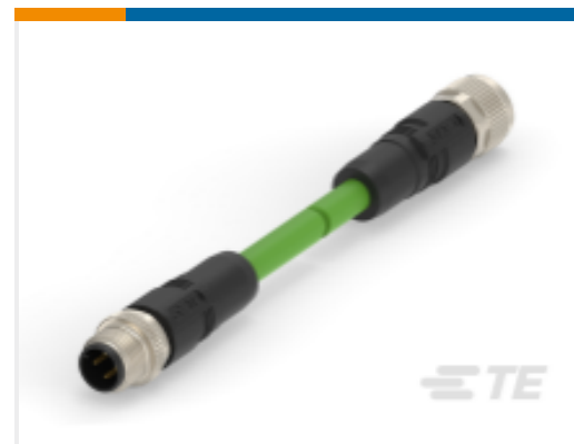
TE Part #TAD14545101-002 M12D4-MS-FS-PUR-22SH-TYPE C GREEN-1.0M