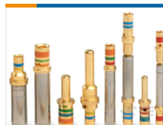
TE Part #12333-22 CONT SOC ASSY