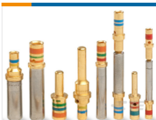
TE Part # 12331-22 CONT PIN (182-0441-22)