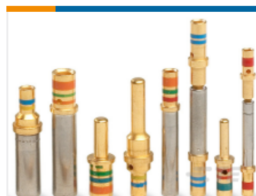
TE Part #12331-22 CONT PIN (182-0441-22)