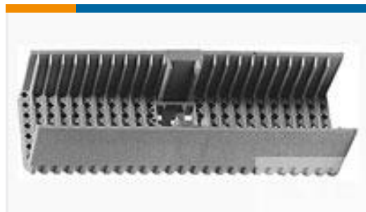
TE Model / Part #646478-5 2MM H.M., "A" SHROUD, 4.5MM