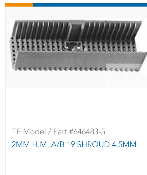
TE Model / Part #646483-5 2MM H.M.,A/B 19 SHROUD 4.5MM