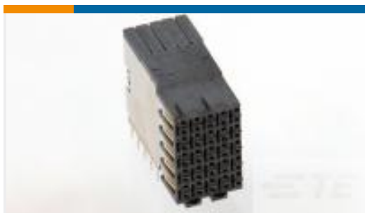
TE Model / Part # 5120743-1 Z-PACK HS3 SHRD ASSY