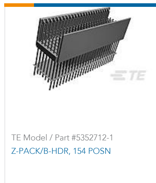
TE Model / Part #5352712-1 Z-PACK/B-HDR, 154 POSN