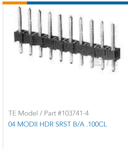
TE Model / Part #103741-4 04 MODII HDR SRST B/A .100CL