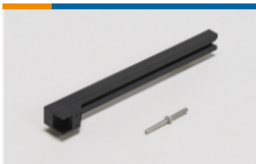
Header & Receptacle Guide Hardware (1)