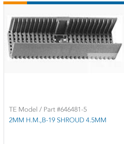
TE Model / Part #646481-5 2MM H.M.,B-19 SHROUD 4.5MM