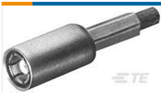
TE Model / Part #5414946-2 PLUG, CBL, STR, SMB, PB FREE