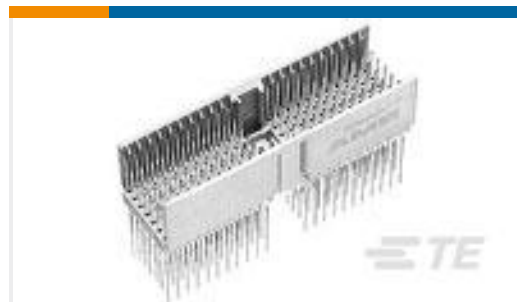
TE Model / Part #5188578-1 Z-PACK/A M HDR.154P