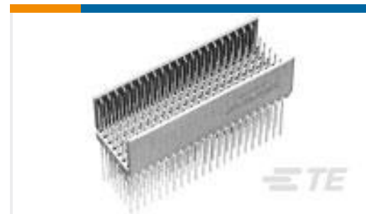
TE Model / Part #5352128-1 Z-PACK T-B MALE HEADER 154P