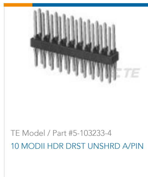
TE Model / Part #5-103233-4 10 MODII HDR DRST UNSHRD A/PIN