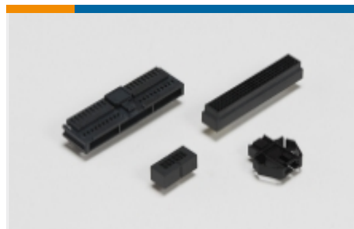
PCB Connector Shrouds(2)