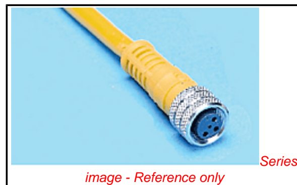
image - Reference only