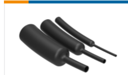
TE Part #5677954003 RNF-3000 Heat Shrink Tubing