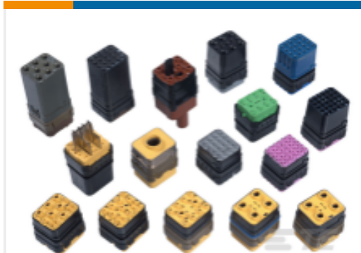
TE Part #ZPF000000000206299 DMC-M 22-07 PB