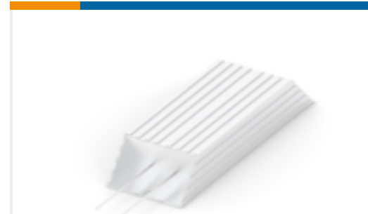
TE Part #1-2176507-2 CJP 200W 4R7 5% Lead