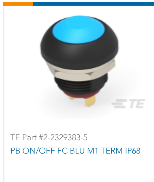
TE Part #2-2329383-5 PB ON/OFF FC BLU M1 TERM IP68