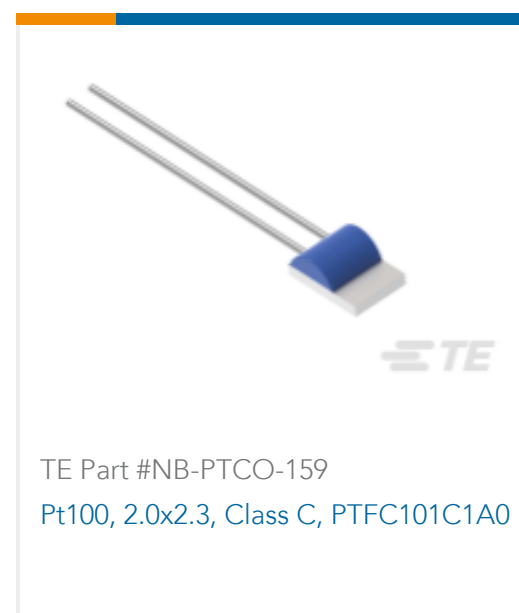
TE Part #NB-PTCO-159 Pt100, 2.0x2.3, Class C, PTFC101C1A0