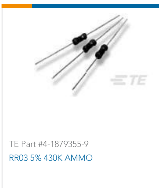
TE Part #4-1879355-9 RR03 5% 430K AMMO