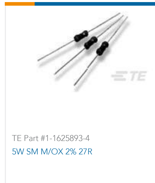
TE Part #1-1625893-4 5W SM M/OX 2% 27R