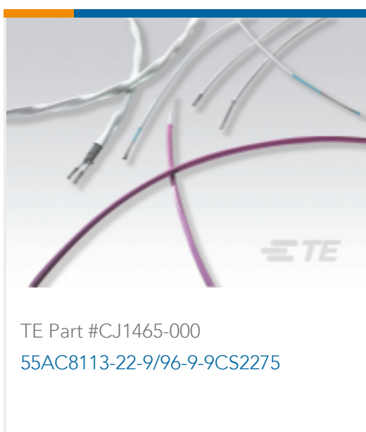
TE Part #CJ1465-000 55AC8113-22-9/96-9-9CS2275