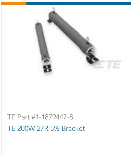
TE Part #1-1879447-8 TE 200W 27R 5% Bracket