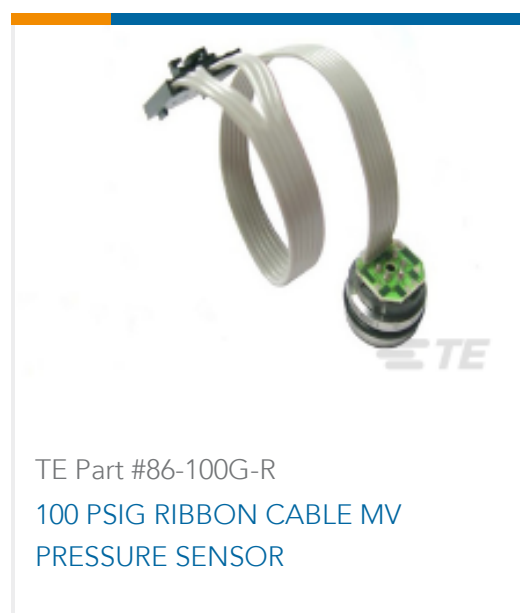
TE Part #86-100G-R 100 PSIG RIBBON CABLE MV PRESSURE SENSOR