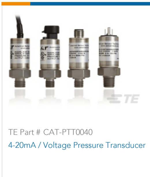
TE Part # CAT-PTT0040 4-20mA / Voltage Pressure Transducer