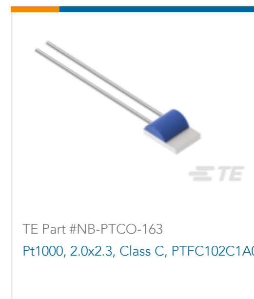
TE Part #NB-PTCO-163 Pt1000, 2.0x2.3, Class C, PTFC102C1A0