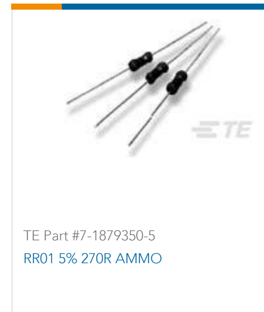
TE Part #7-1879350-5 RR01 5% 270R AMMO