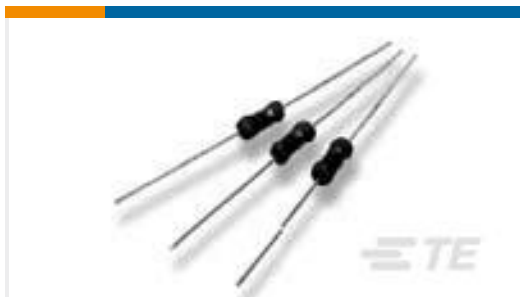
TE Part #4-1879355-9 RR03 5% 430K AMMO