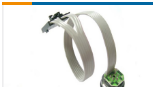
TE Part #86-100G-R 100 PSIG RIBBON CABLE MV PRESSURE SENSOR