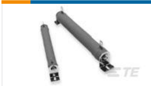
TE Part #1-1879447-8 TE 200W 27R 5% Bracket