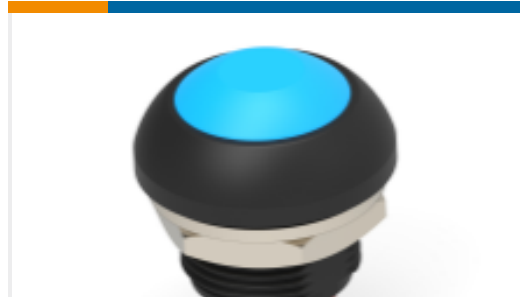
TE Part #2-2329383-5 PB ON/OFF FC BLU M1 TERM IP68