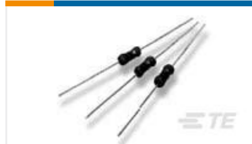
TE Part #7-1879350-5 RR01 5% 270R AMMO