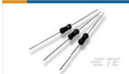
TE Part #1-1625893-4 5W SM M/OX 2% 27R