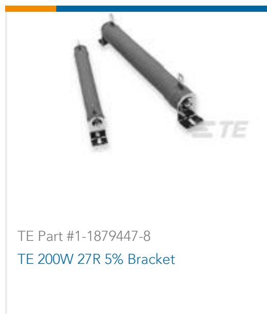
TE Part #1-1879447-8 TE 200W 27R 5% Bracket