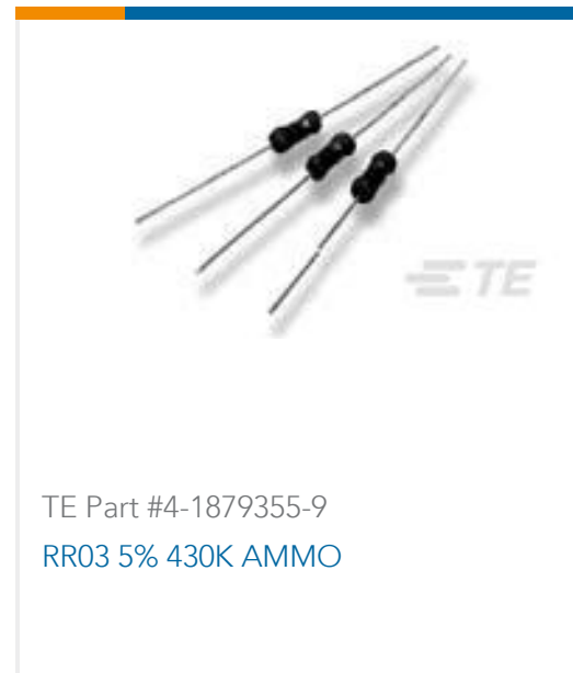
TE Part #4-1879355-9 RR03 5% 430K AMMO