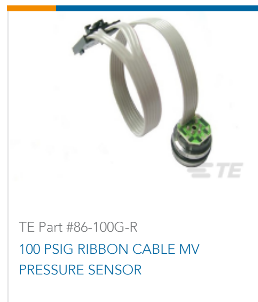
TE Part #86-100G-R 100 PSIG RIBBON CABLE MV PRESSURE SENSOR