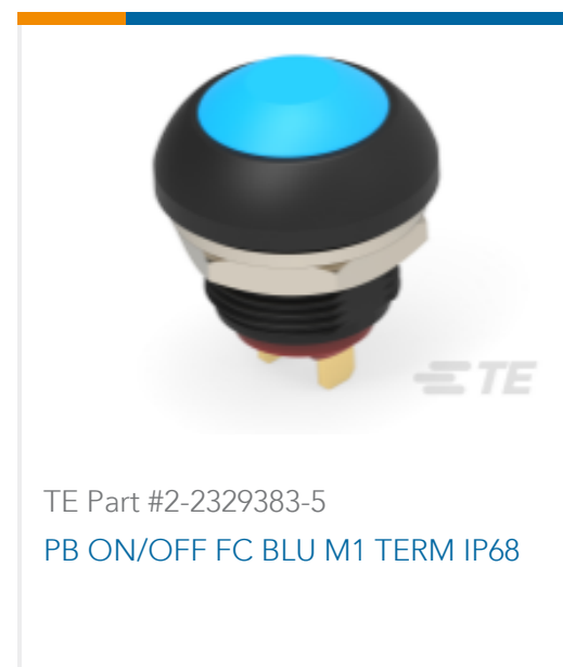
TE Part #2-2329383-5 PB ON/OFF FC BLU M1 TERM IP68