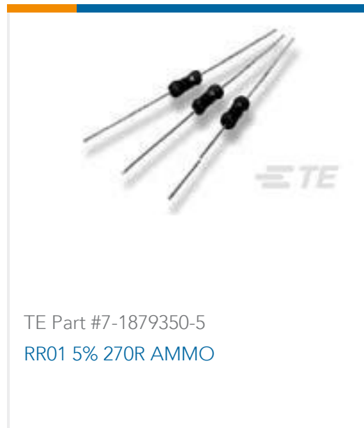
TE Part #7-1879350-5 RR01 5% 270R AMMO