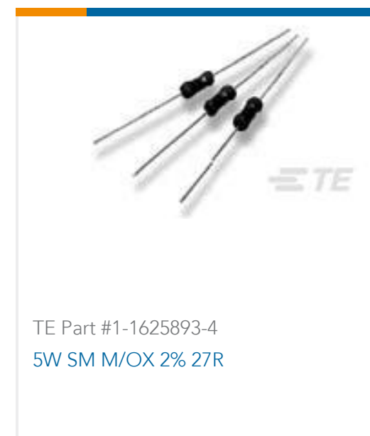
TE Part #1-1625893-4 5W SM M/OX 2% 27R