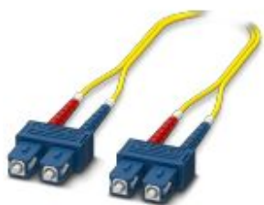
Single-mode OS2 duplex jumper, SC-SC, UPC polishing, length 5 m

Please be informed that the data shown in this PDF Document is generated from our Online Catalog. Please find the complete data in the user's documentation. Our General Terms of Use for Downloads are valid ( http://phoenixcontact.com/download )