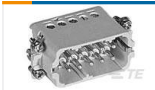
TE Part #2-1103638-3 HE.16.STI.C.B 1-16