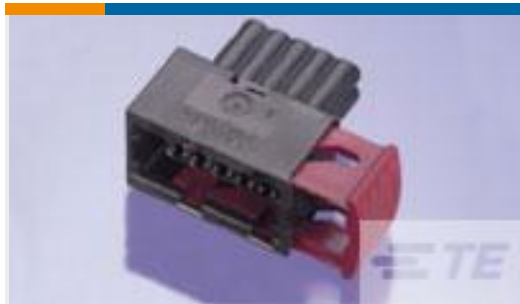
TE Part #2-967059-1 J-P-T GEH KOMPL 4P