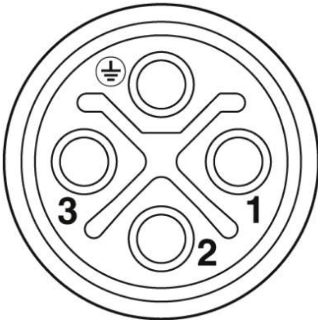
Pin assignment of M12 socket, 4-pos., S-coded, socket side view