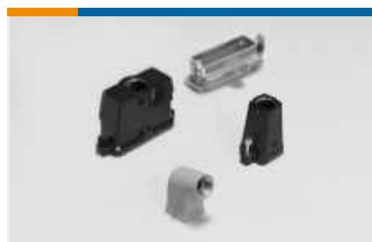
Rectangular Connector Hoods & Bases (1258)