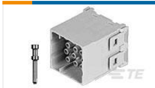
TE Part #1103144-1 HVS-HE.20.Sti.C