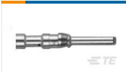
TE Part #3-1105300-1 HVT-C-Sti.Ag.1,5 qmm