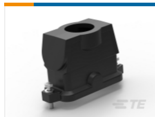
TE Part #T1922160140-000 H16BPR-TGHC-M40