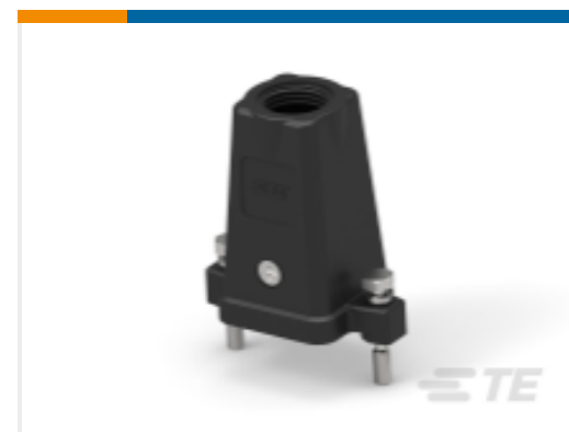
TE Part #T1926030116-009 H3APR-TGC-M16-EMC-C