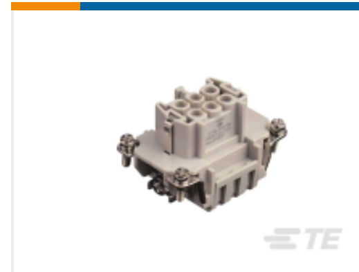
TE Part #T2040064201-000 HE-006-FC