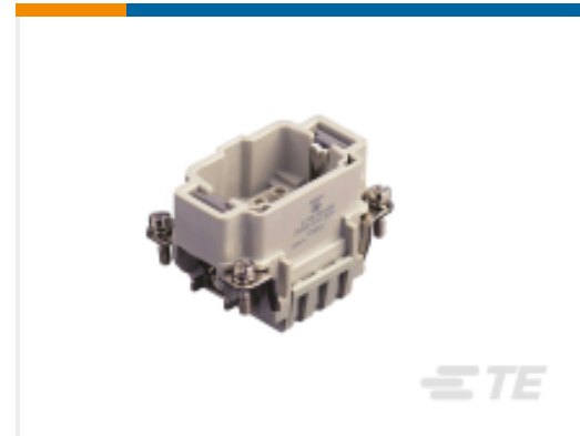
TE Part #T2040064101-000 HE-006-MC