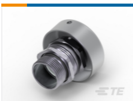
TE Part #T3900250250-000 M25X1.5 VA-25-LM