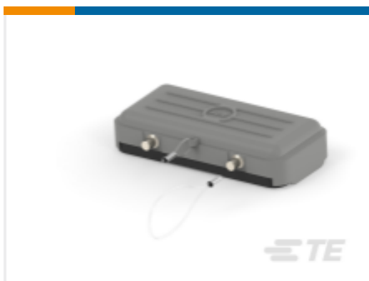
TE Part #T1010161600-000 H16B-KDTP-BO