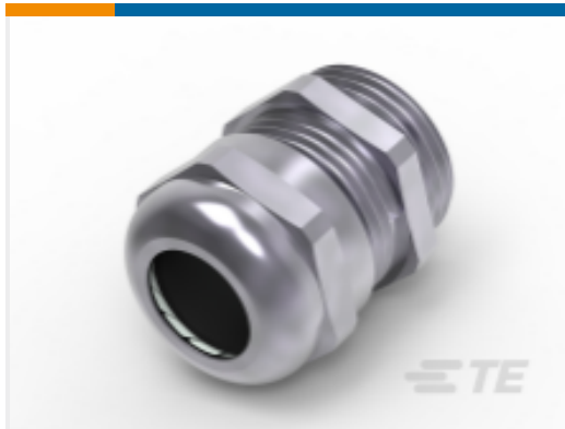
TE Part #T3609200102-000 DLX-20-M