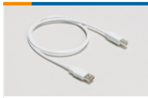
USB Cable Assemblies(1)