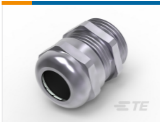
TE Part #T3609200102-000 DLX-20-M