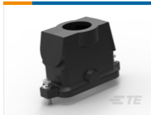
TE Part #T1922160140-000 H16BPR-TGHC-M40