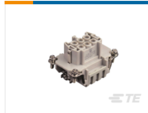
TE Part #T2040064201-000 HE-006-FC