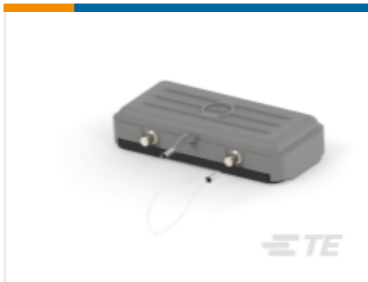
TE Part #T1010161600-000 H16B-KDTP-BO