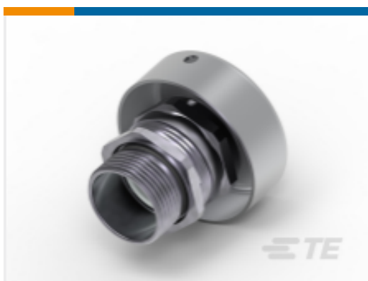
TE Part #T3900250250-000 M25X1.5 VA-25-LM