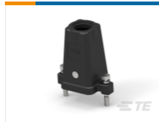
TE Part #T1926030116-009 H3APR-TGC-M16-EMC-C