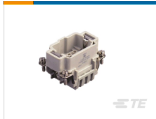
TE Part #T2040064101-000 HE-006-MC