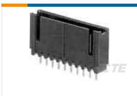
TE Part #5-103080-1 03 MODII HDR SRST SHRD .100CL