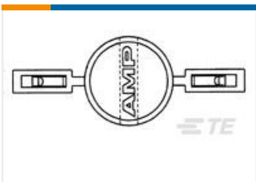
TE Part #499991-2 POLARIZER AMP-LATCH 50/BAG