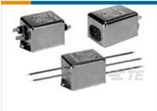
TE Part #1-6609037-0 20EP6=F7810 S0