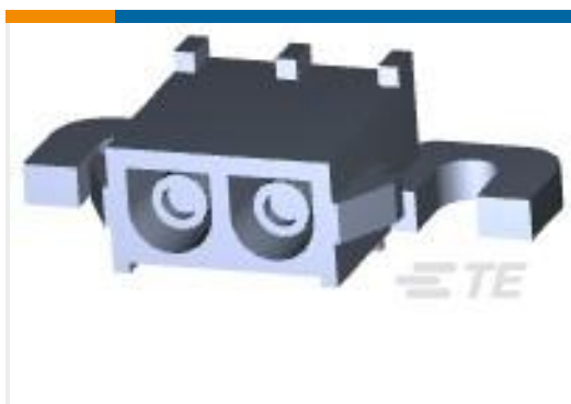
TE Part #193839-1 SKT HDR, RIGHT ANGLE