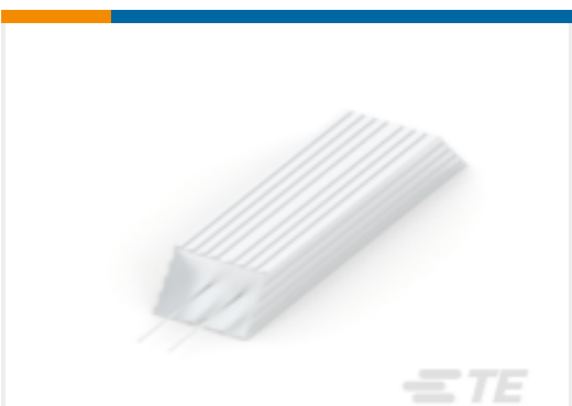
TE Part #2-2176508-4 CJP 300W 47R 5% Lead