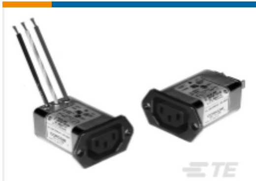
TE Part #6609018-7 Corcom IEC-filtered Inlets, EBF-Series