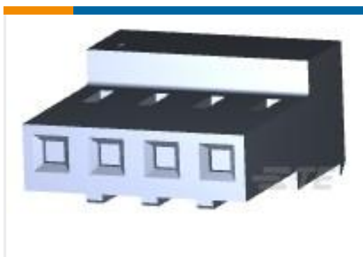
TE Part #3-640431-4 04P MTA156 CONN ASSY 18AWG ORA