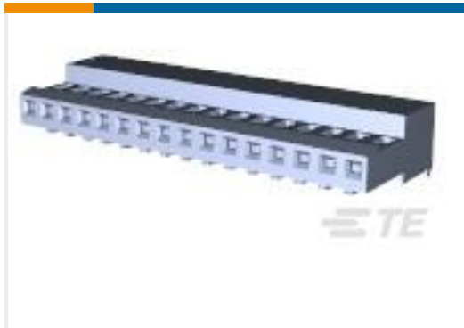
TE Part #4-640440-6 16P MTA100 CONN ASSY 22AWG RED