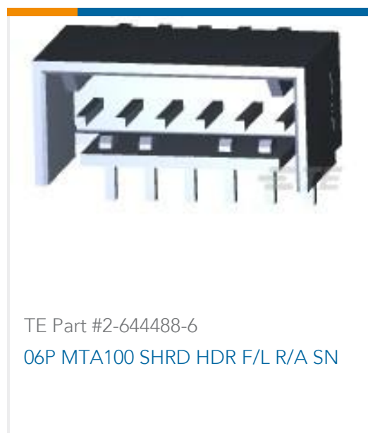
TE Part #2-644488-6 06P MTA100 SHRDR HDR F/L R/A SN