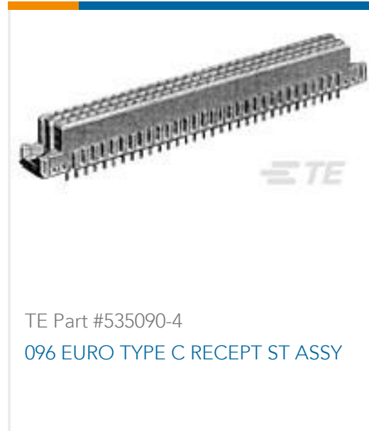
TE Part #535090-4 09% EURO TYPE C RECEPT ST ASSY