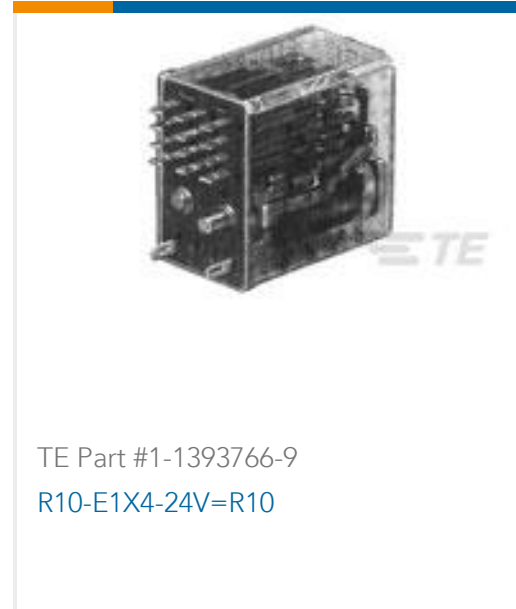
TE Part #1-1393766-9 R10-E1X4-24V=R10