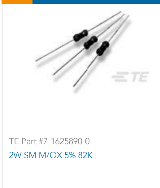
TE Part #7-1625890-0 2W SM M/OX 5% 82K