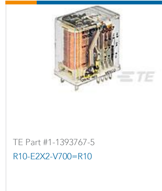
TE Part #1-1393767-5 R10-E2X2-V700=R10