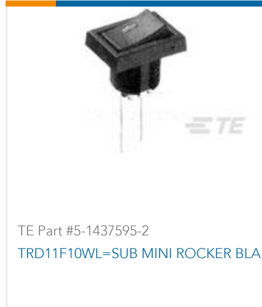
TE Part #5-1437595-2 TRD11F10WL=SUB MINI ROCKER BLA