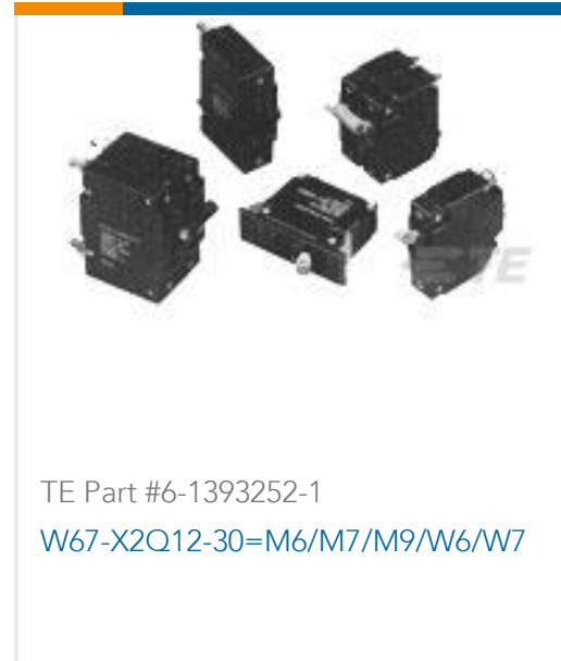
TE Part #6-1393252-1 W67-X2Q12-30=M6/M7/M9/W6/W7