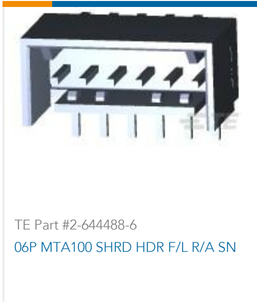
TE Part #2-644488-6 06P MTA100 SHRD HDR F/L R/A SN